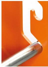
Adjustment stop bar