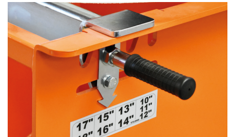
Work surface with rim size adjustment bar