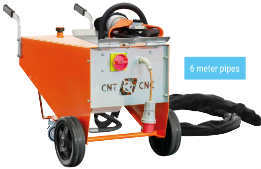
6 meter pipes