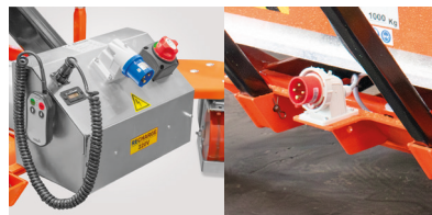
Option with rechargeable battery or 380 V power supply