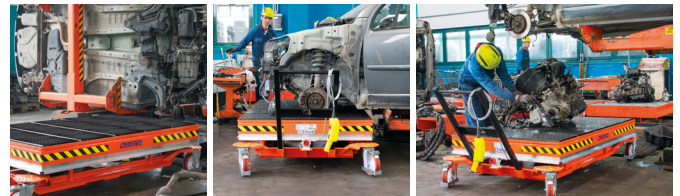
Compatible with Iris-Mec lifts

Lift table for engine disassembly and spare parts