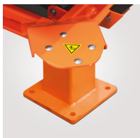
Option without wheels for areas with no need of mobility