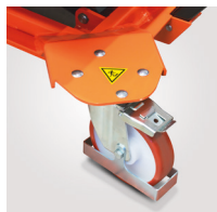
With wheels for easy handling and movement