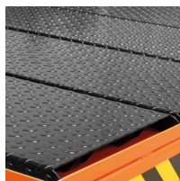
Scratch-resistant surface for engine protection