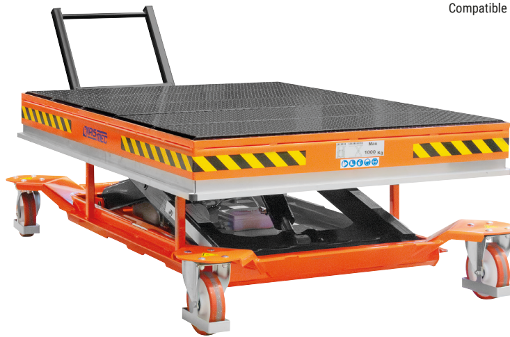
Optimum manoeuvrability in tight spaces